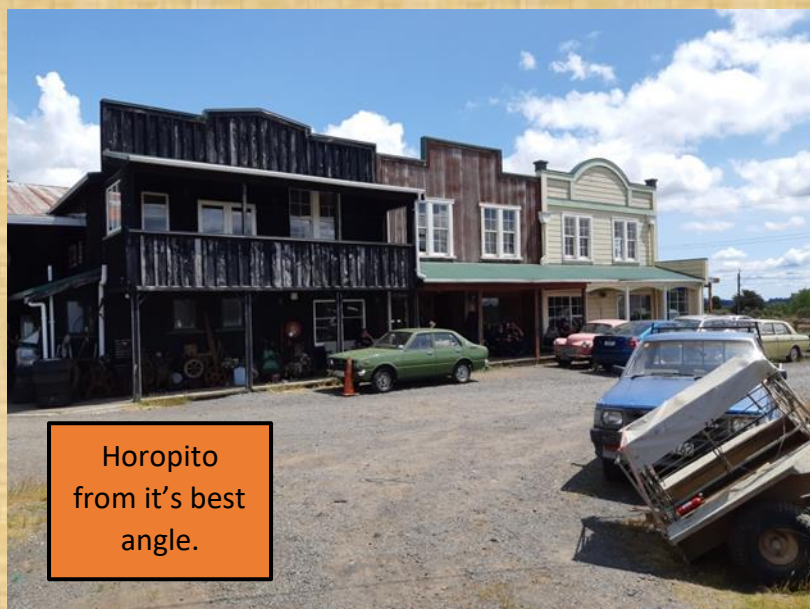
Horopito from it's best angle.

Taumarunui. From here we rode through Owango, National Park and stopped at the World Famous in New Zealand, Horopito. Well, the modern times have