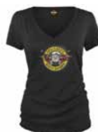
GUNS N' ROSES COVER VNECK S/S TOP NZD $69.00