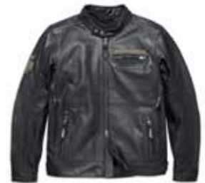
115TH ANNIVERSARY JACKET JACKET NZD $989.00