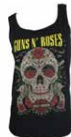
H-D X GNR BANDITO TANK NZD $65.00

BROWSE THE FULL COLLECTIONS ONLINE AT WWW.ROADANDSPORT.CO.NZ