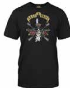
H-D X GNR TOP HAT SHORT SLEEVE TEE NZD $59.00