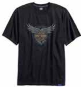
115TH ANNIVERSARY GRAPHIC SHORT SLEEVE TEE NZD $79.00