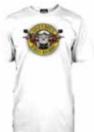
H-D X GNR COVER WHITE SHORT SLEEVE TEE NZD $59.00