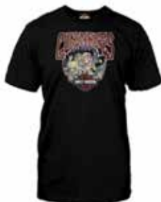
H-D X GNR SKELETONS S/S TOP NZD $69.00