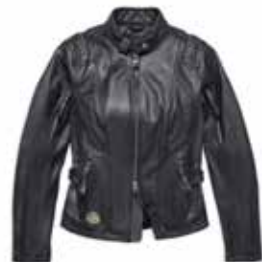
115TH ANNIVERSARY JACKET JACKET NZD $899.00