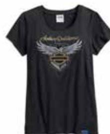
115TH ANNIVERSARY METALLIC SHORT SLEEVE TEE NZD $79.00