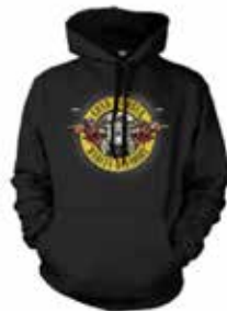
H-D X GNR COVER HOODIE NZD $139.00