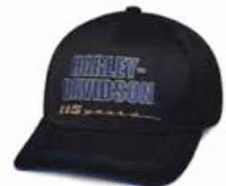
115TH ANNIVERSARY ADJUSTABLE CAP CAP NZD $49.00