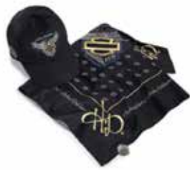
115TH RIDEPACK, 3PIECE RIDE PACK NZD $69.00