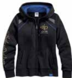
115TH ANNIVERSARY SWEATSHIRT-115TH SWEATSHIRT NZD $159.00