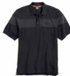
115TH POLO COLDBLACK POLO TEE NZD $139.00