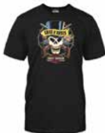
H-D X GNR BARBED SHORT SLEEVE TEE NZD $59.00