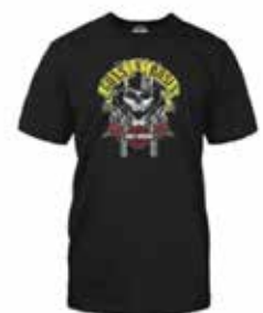
H-D X GNR RAGE SHORT SLEEVE TEE NZD $59.00